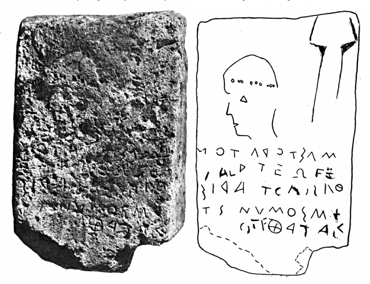
Fig. 5. A photo of a monument No 5 and its portrayal

The technique which was outlined in the monograph [2] gave me back in 2001 an opportunity to read the hidden text of the epitaph written on the stone which had been found by Skadovsky in 1900, on the necropolis of the island Berezan'. The epitaph written on this stone recorded the dates of birth and death of Homer [2, pp. 69-76; 3, pp. 93-101]. It was the first experience of reading the hidden texts in the lapidary inscriptions of the archaic era. But here you need to specify the date of the death of Homer that was not definitely stated there. The monument didn't survive, the only thing left is photo, here you can see the drawing of it (see Figure 5).